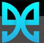
FIGURE OUT THE NEXT STEP